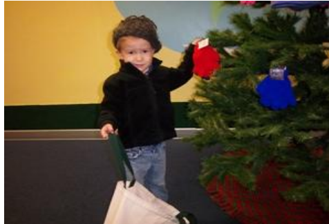
The children really enjoyed decorating our tree!