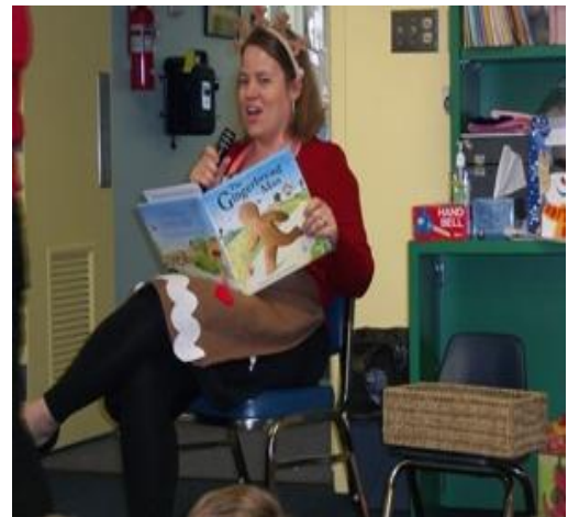
The teachers had so much fun performing "The Gingerbread Man" for the children before the holiday vacation.